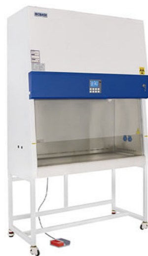
Button Screen Type

Touch operation, real-time and clearer display of various values and appointment timing function.