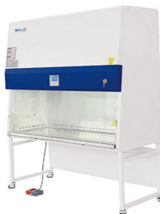
Button Screen Type