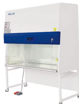
Color Touch Screen Type